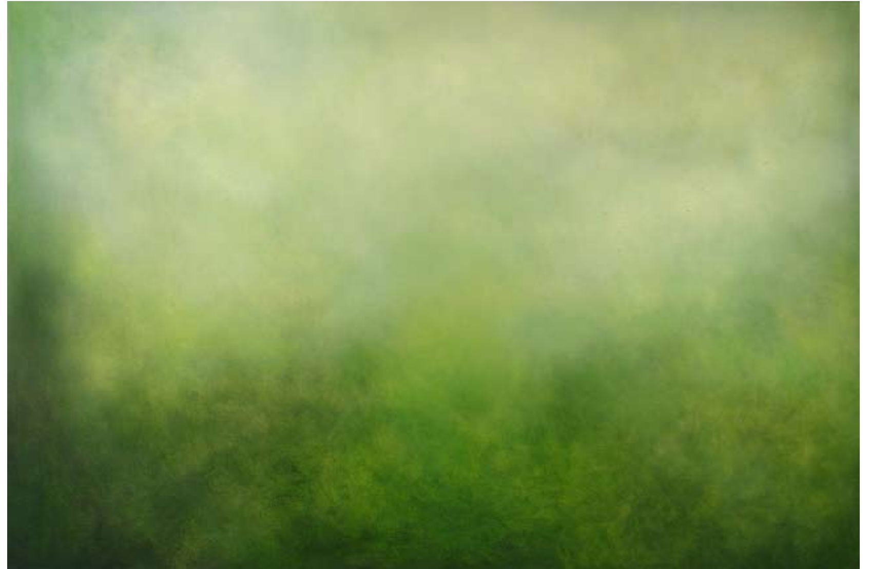
ODE TO TEMAIR, 2007-8, oil on canvas, 48 x 72 in. 122 x 183 cm.