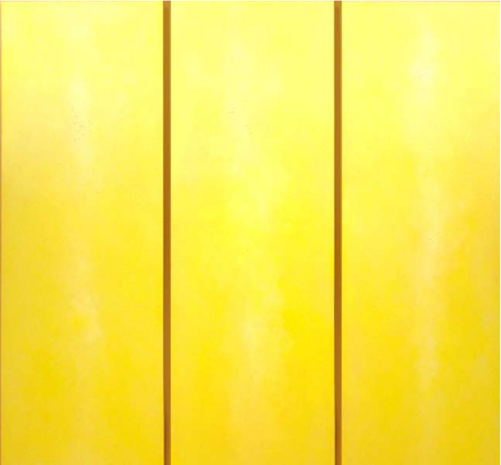
BRIGHT, LIGHT, BRIGHT, 2008, oil on canvas, triptych, 61 x 61 in. 155 x 155 cm.