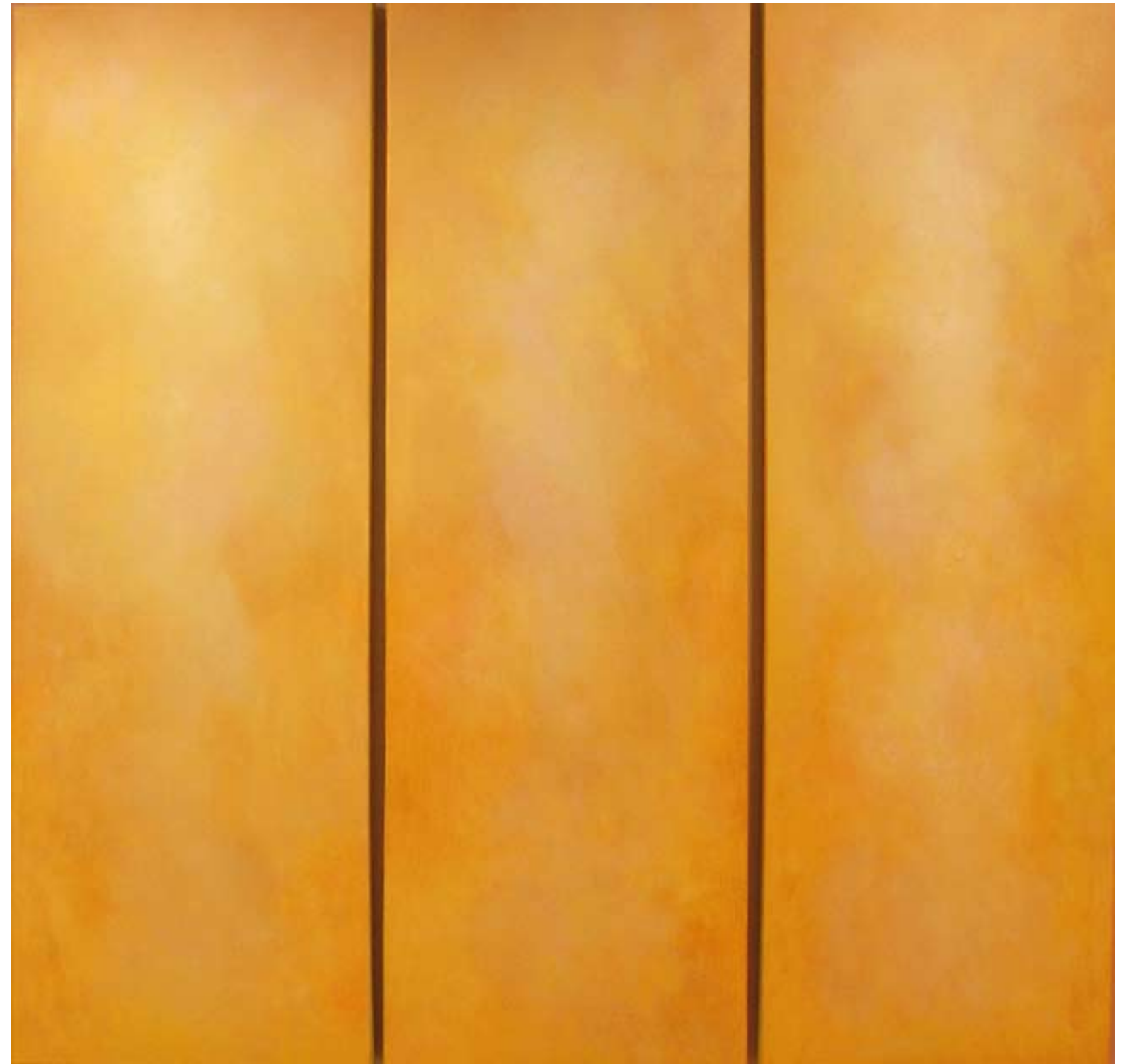
OCHRE, RISING PALE, 2008, oil on canvas, triptych, 61 x 61 in. 155 x 155 cm.