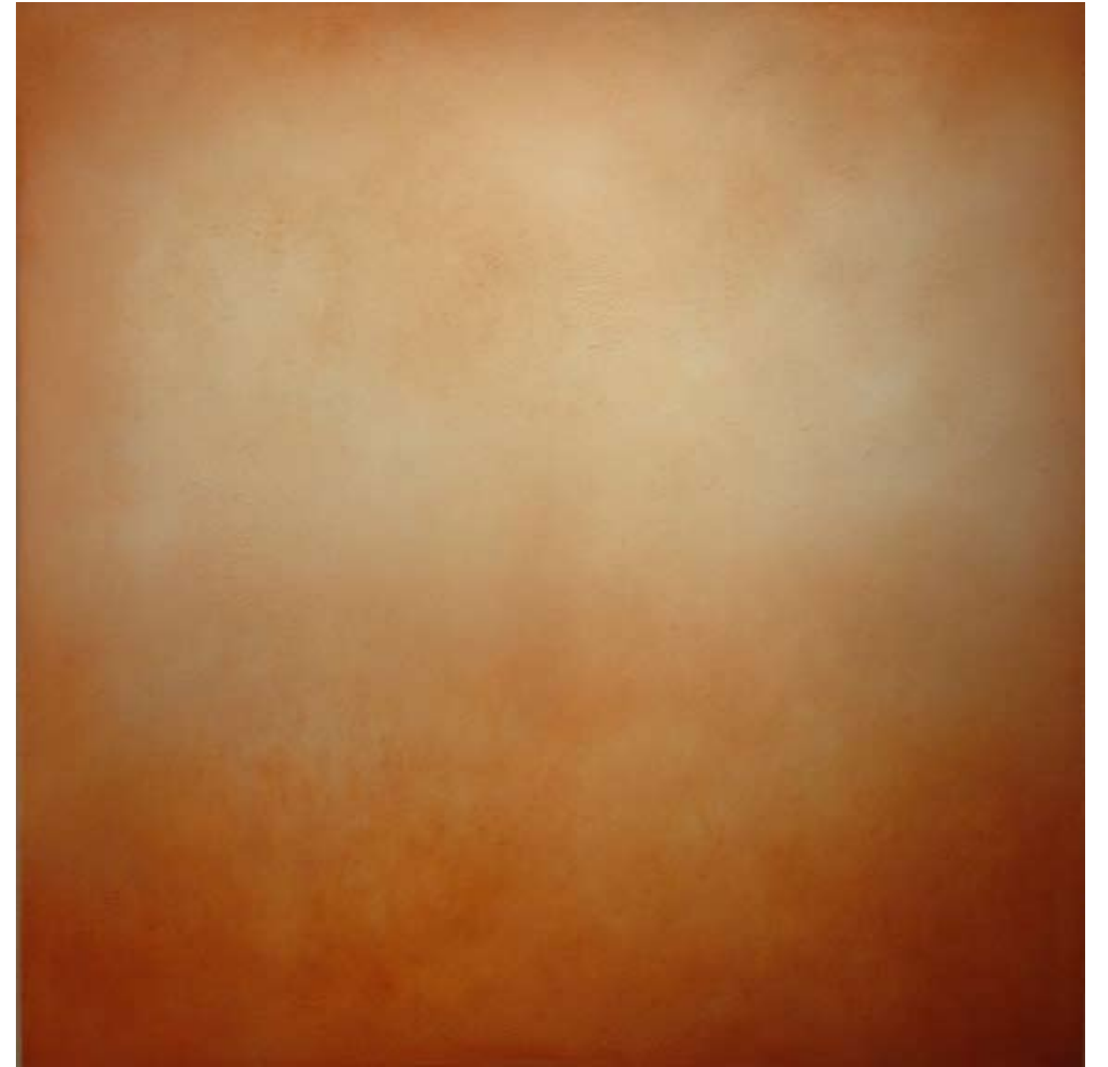
ROSE IS ROSE IS ROSE, 2007, oil on canvas, 36 x 36 in. 91.4 x 91.4 cm.