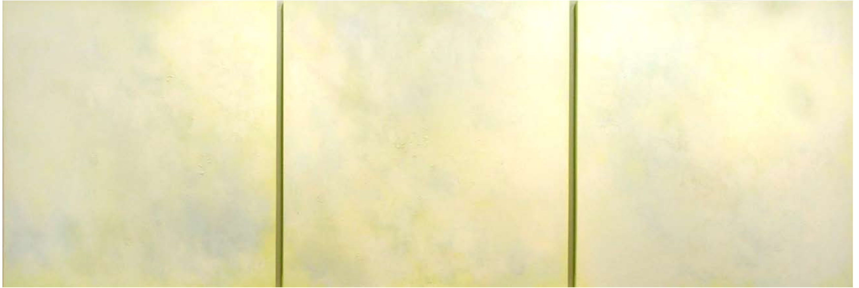
LIGHT SEQUENCE, 2007-8, oil on canvas, triptych, 60 x 180 in. 152.4 x 457 cm.