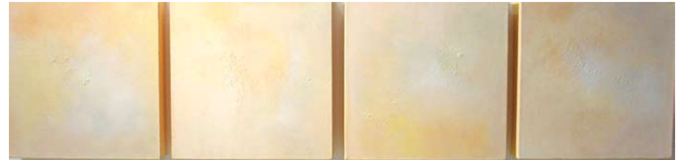
QUARTET IN PINK, 2007, oil on canvas, 4 panels, 12 x 51 ½ in. 30.5 x 130.8 cm.