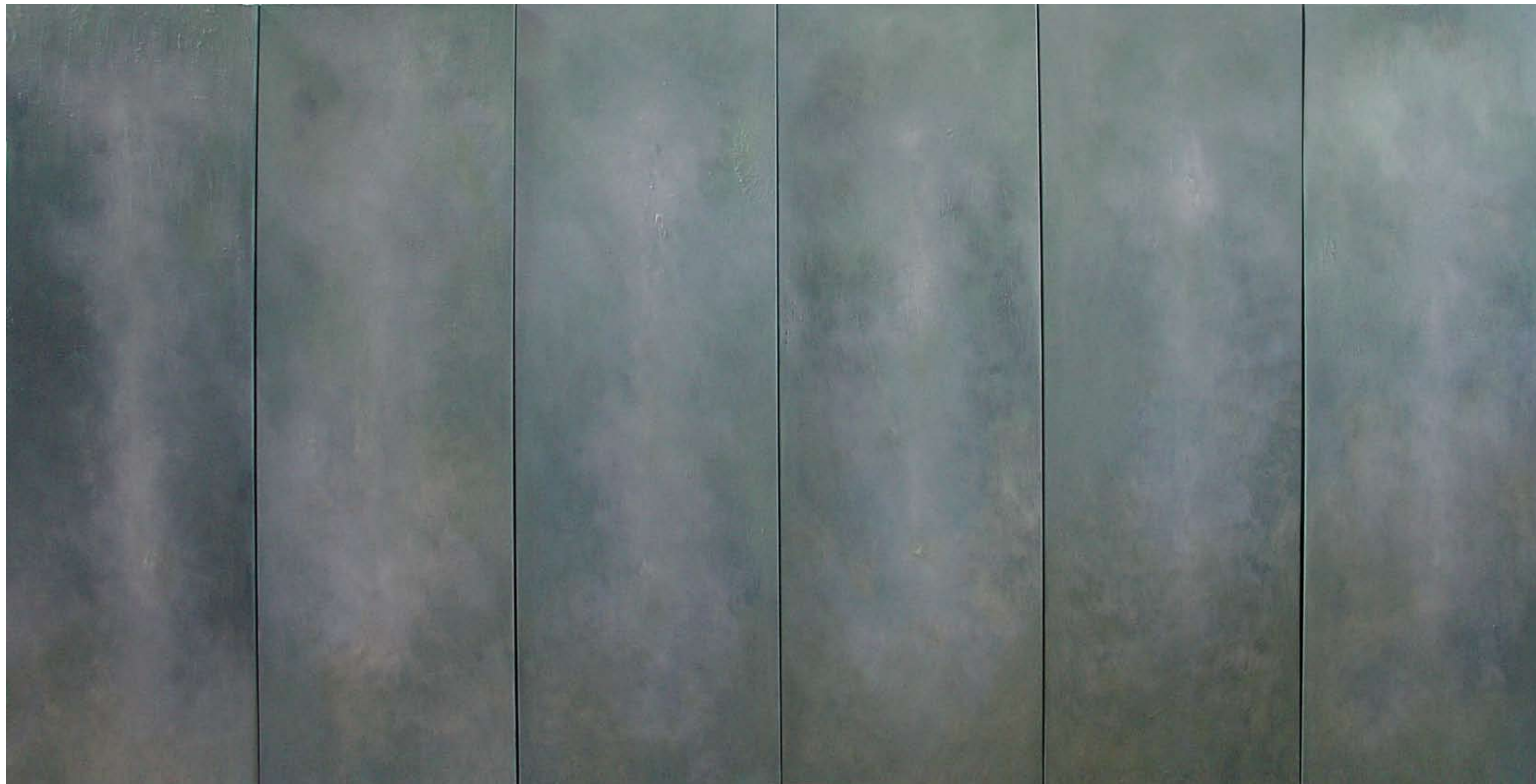
WALKING IN RUMI'S GARDEN, 2007-8, oil on canvas, 6 panels, 60 x 122½ in. 152.4 x 311.2 cm.