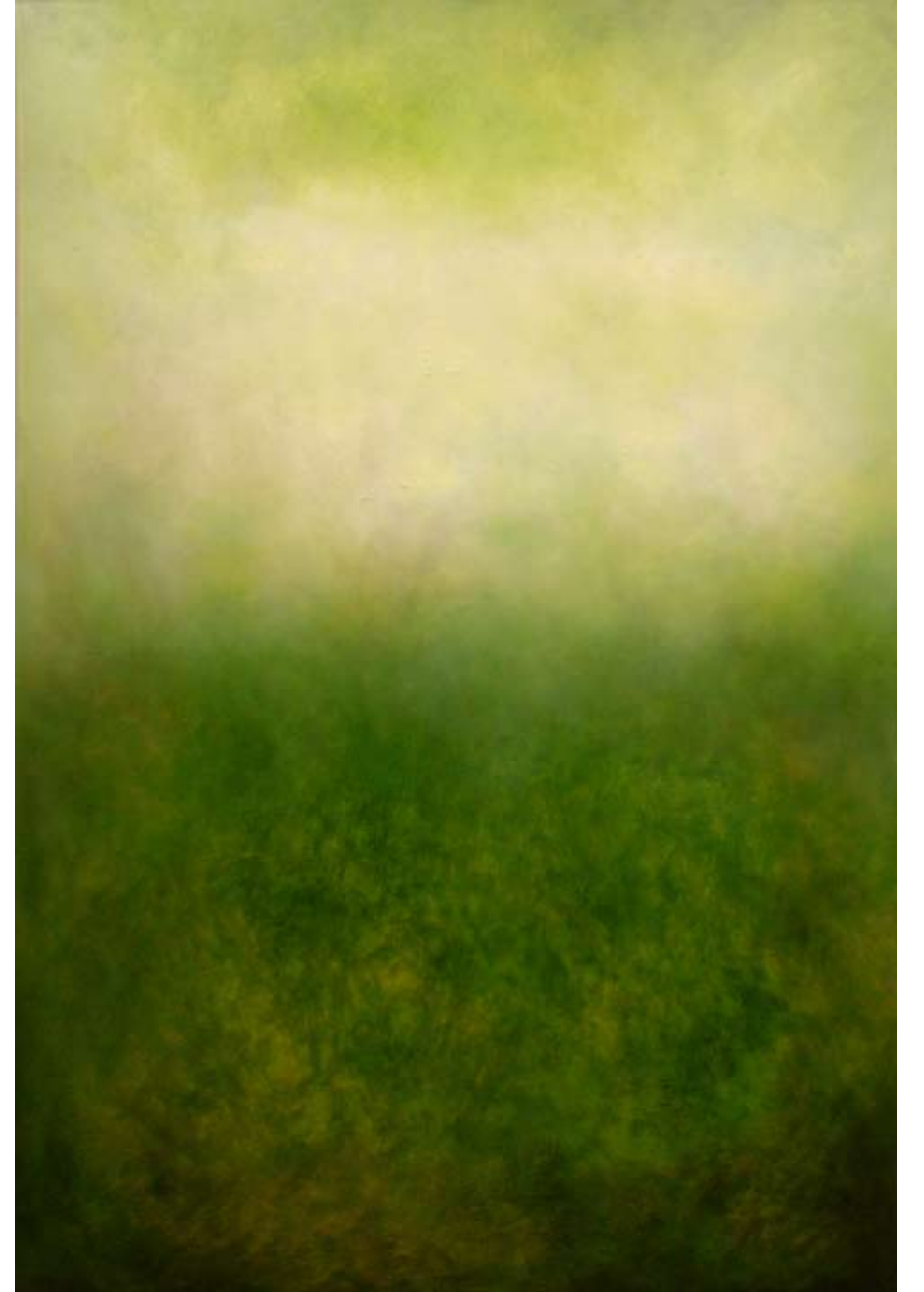
GREEN, RISING, GREEN, 2007-8, oil on canvas, 72 x 48 in. 183 x 122 cm.