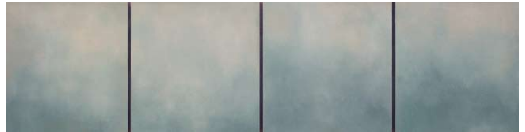
RIVER, BREATH, 2007, oil on canvas, 4 panels, 24 x 97½ in. 61 x 247.7 cm..