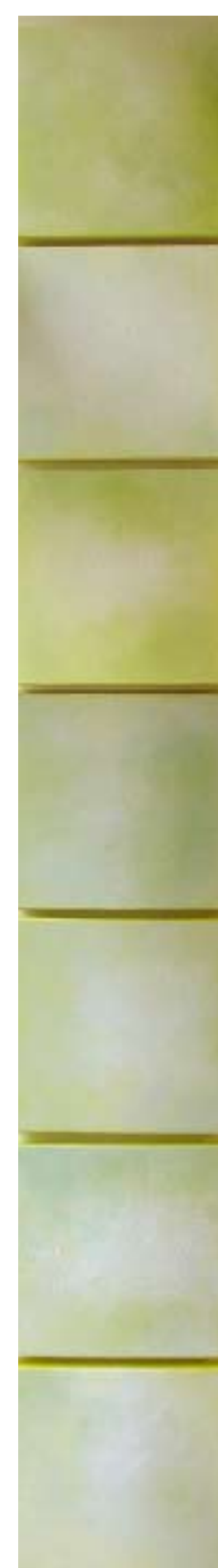
YELLOW - EVERYWHERE, NOWHERE, 2007, oil on canvas, 7 panels, 75 in. x 10 in. 190.5 x 25.4 cm. each