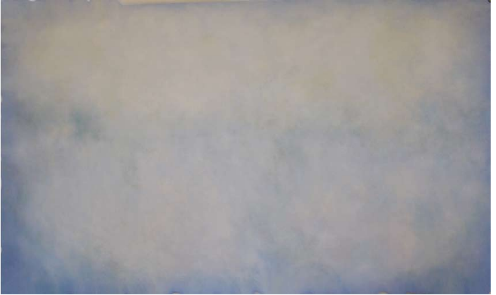
HOMAGE, LA MER, 2009 oil on canvas 84 x 144 in. 213.4 x 366 cm.