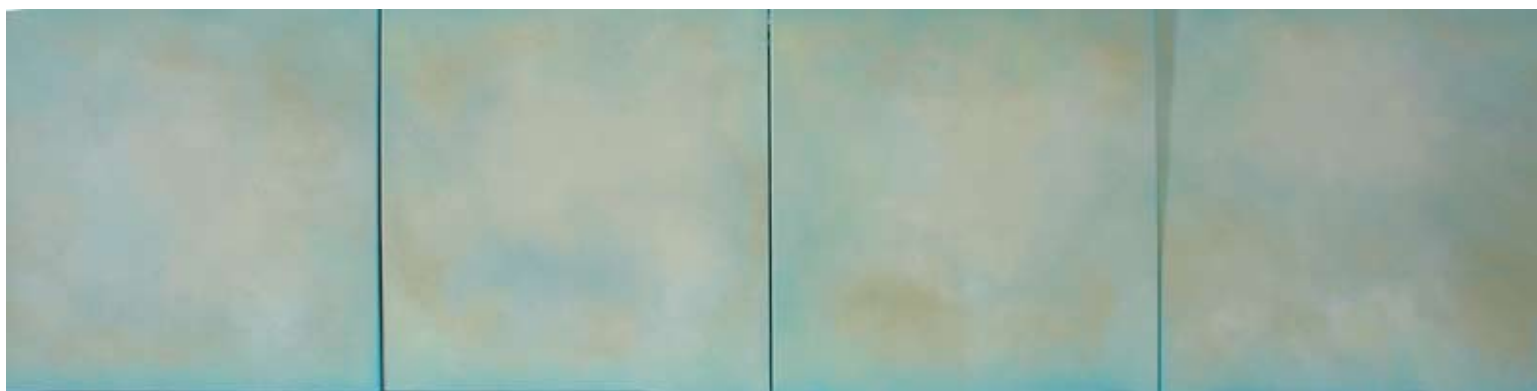
BALINESE QUARTET, 2009 oil on canvas 36 x 144 in. 91.4 x 365.8 cm. 36 x 36 in. 91.4 x 91.4 cm. each