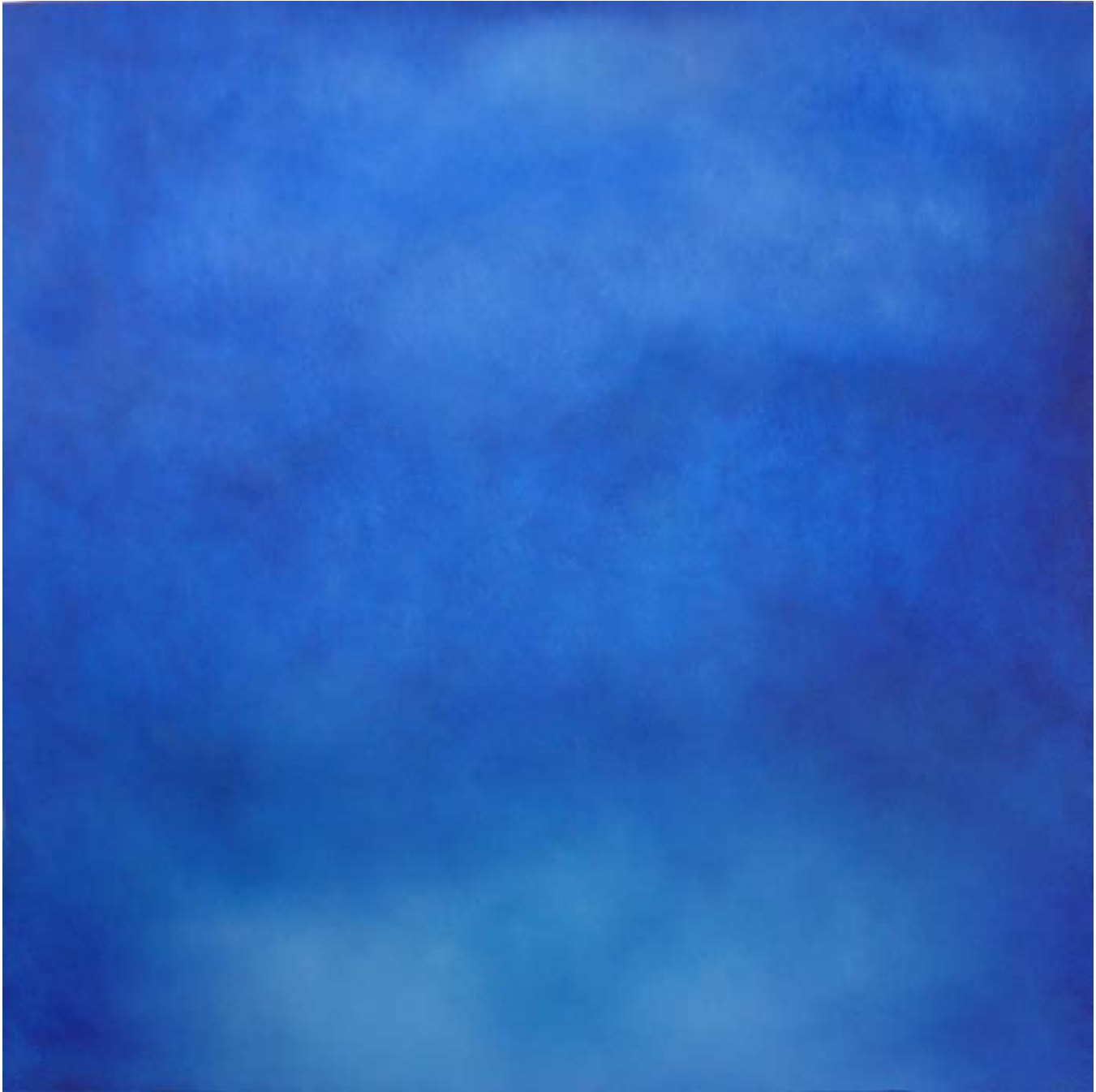
BLUE SILENCE, 2009 oil on canvas 48 x 48 in. 122 x 122 cm.