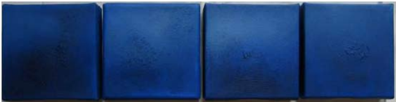
BLUE ORACLE, 2009 oil on canvas, 4 panels 4 x 16 in. 10.2 x 40.6 cm. 4 x 4 in. 10.2 x 10.2 cm. each