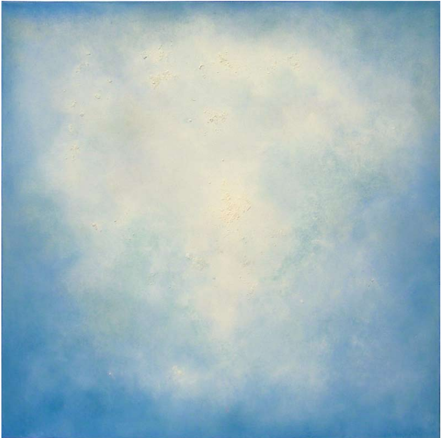
CIRCLE OF BLUE, 2009 oil on canvas 36 x 36 in. 91.4 x 91.4 cm.