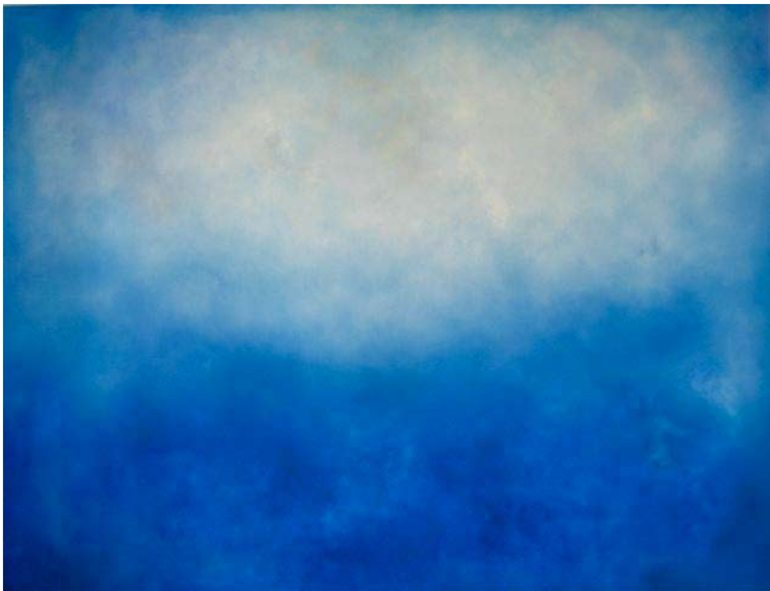
BLUE OM, 2009 oil on canvas 60 x 72 in. 152.5 x 183 cm.