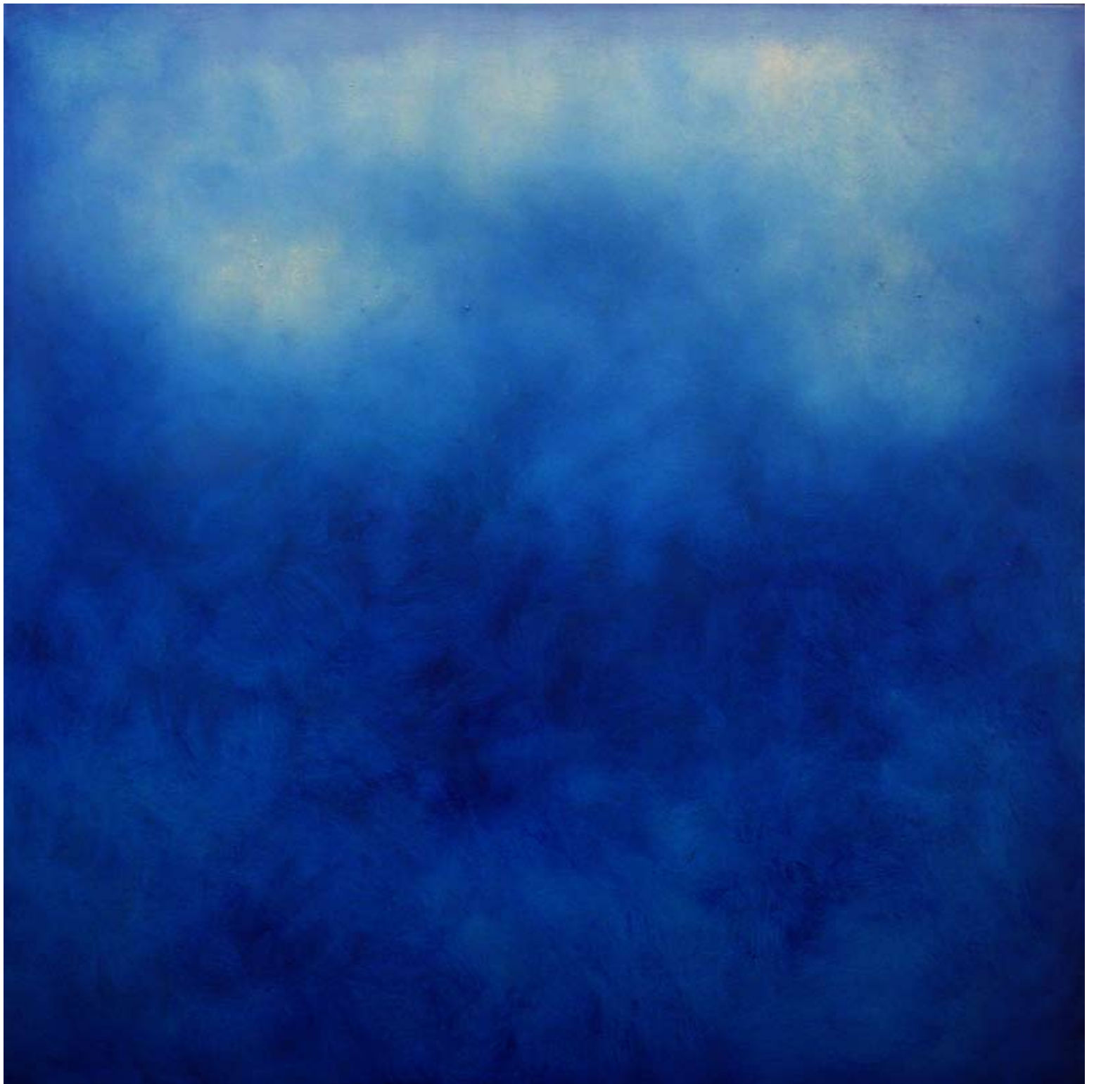
HOPI BLUE SKY, 2009 oil on canvas 36 x 36 in. 91.4 x 91.4 cm.