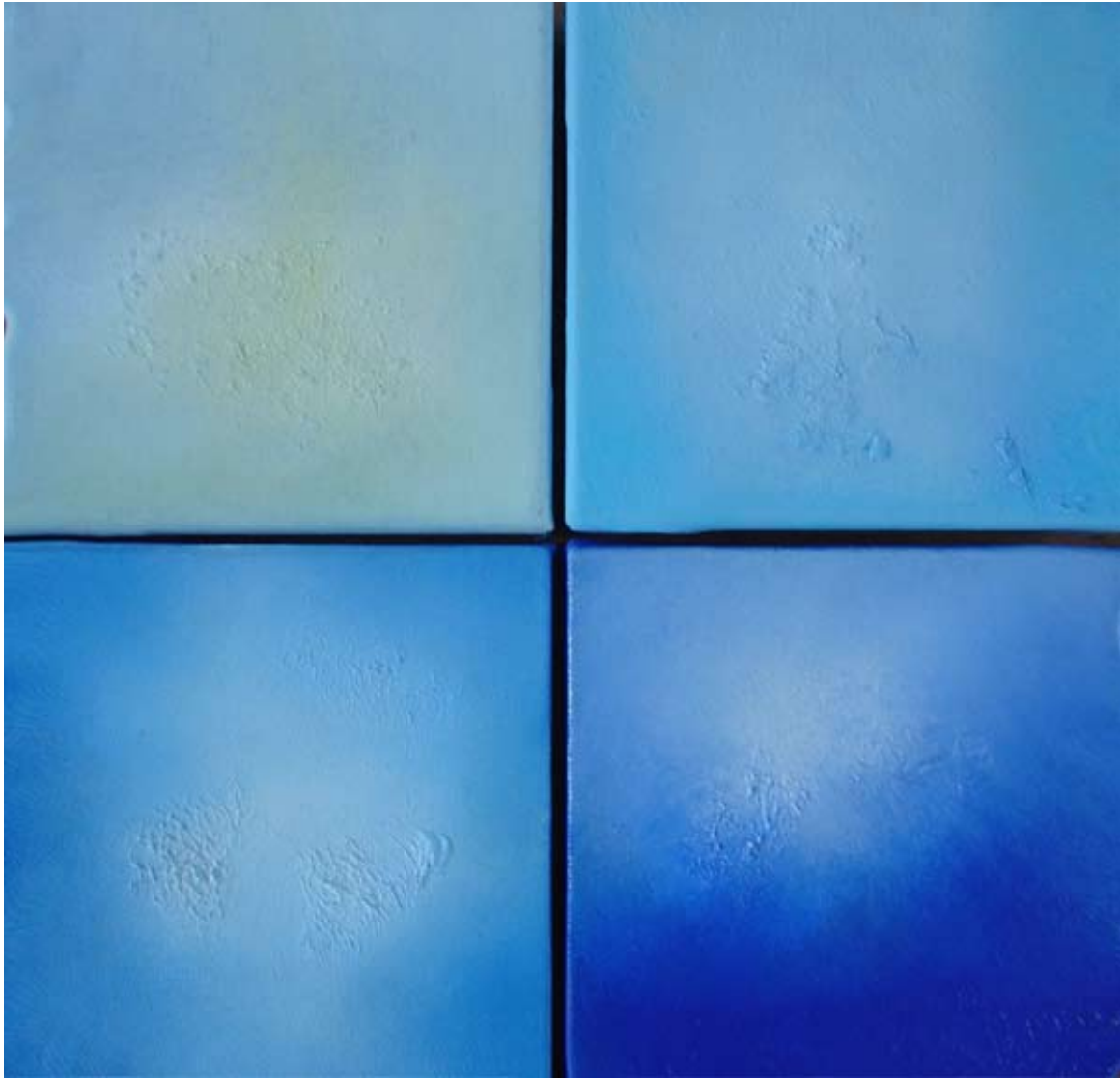
COLLECTION: BLUE LOTUS, BLUE NOTE, LUNA BLUE, BLUE LINE, 2009 oil on canvas, 4 panels 6 x 6 in. 15.2 x 15.2 cm. (each panel)