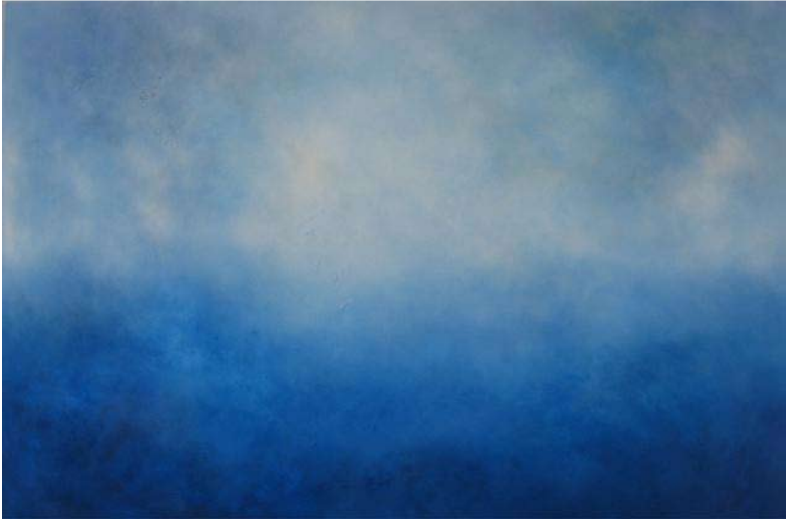
BLUE LIGHT, 2009 oil on canvas 48 x 72 in. 122 x 183 cm.