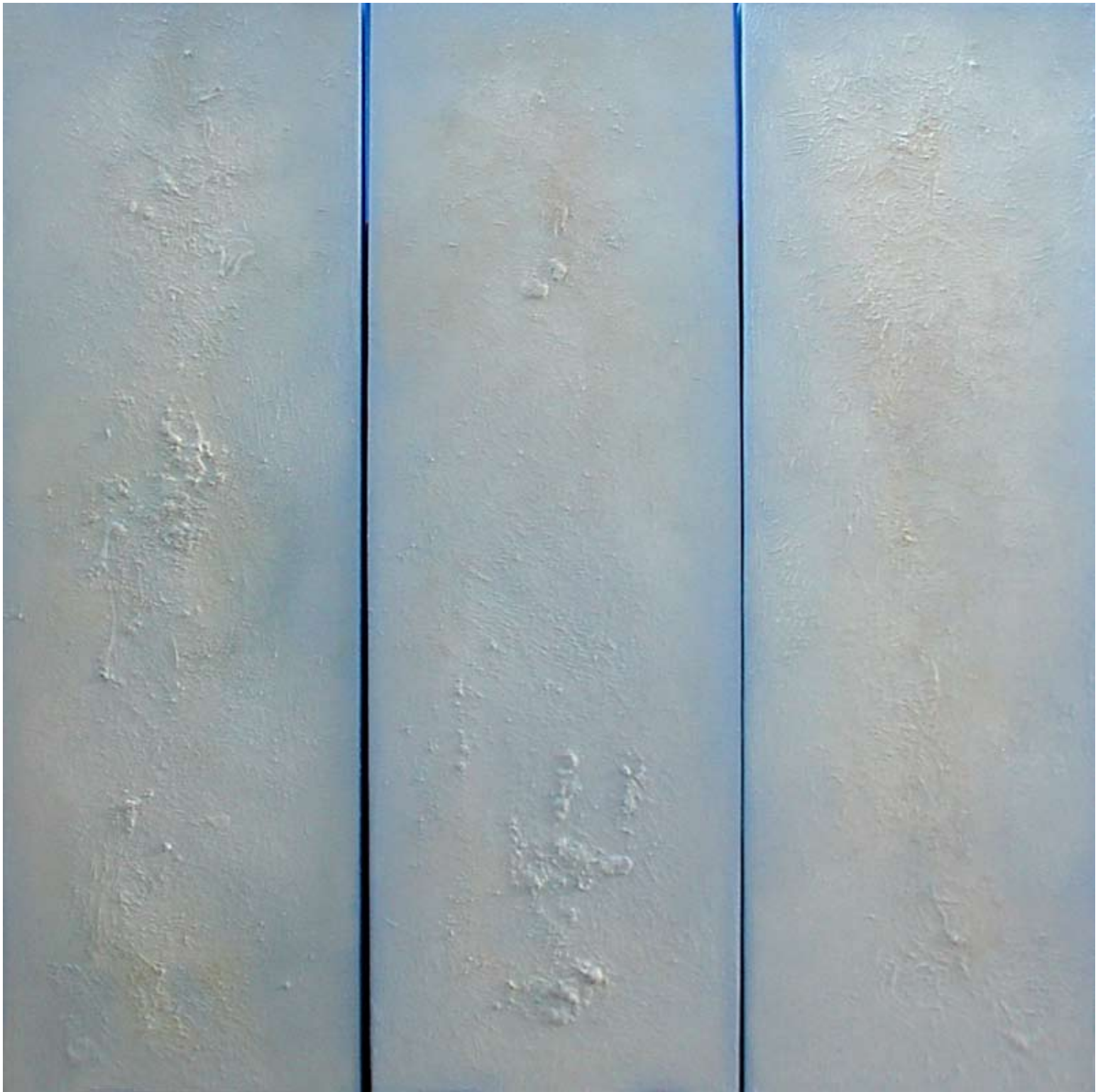
THREE DANCERS, 2009 oil on canvas, triptych 30 x 31 in. 76.2 x 78.8 cm. 30 x 10 in. 76.2 x 25.4 cm. each