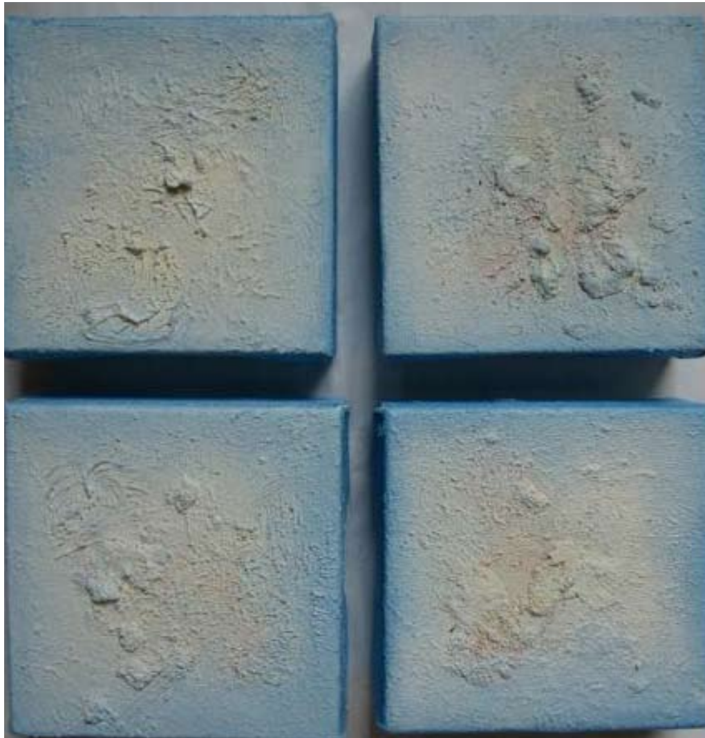
LITTLE ANGELS #3, 2009 oil on canvas, 4 panels 9 x 9 in. 22.8 x 22.8 cm. 4 x 4 in. 10.2 x 10.2 cm. each