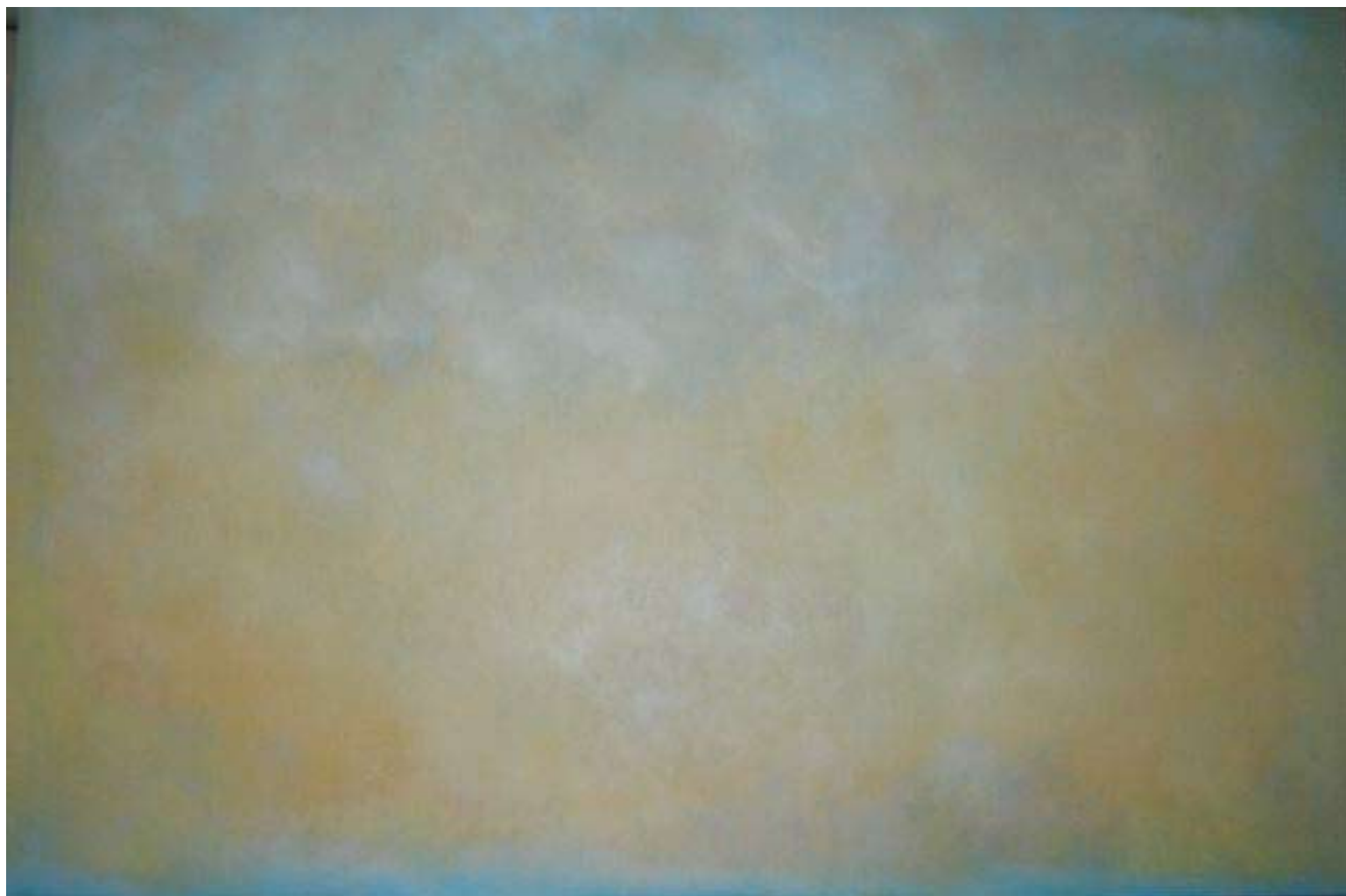
GOLD, RISING OVER BLUE, 2009 oil on canvas 48 x 72 in. 122 x 183 cm.