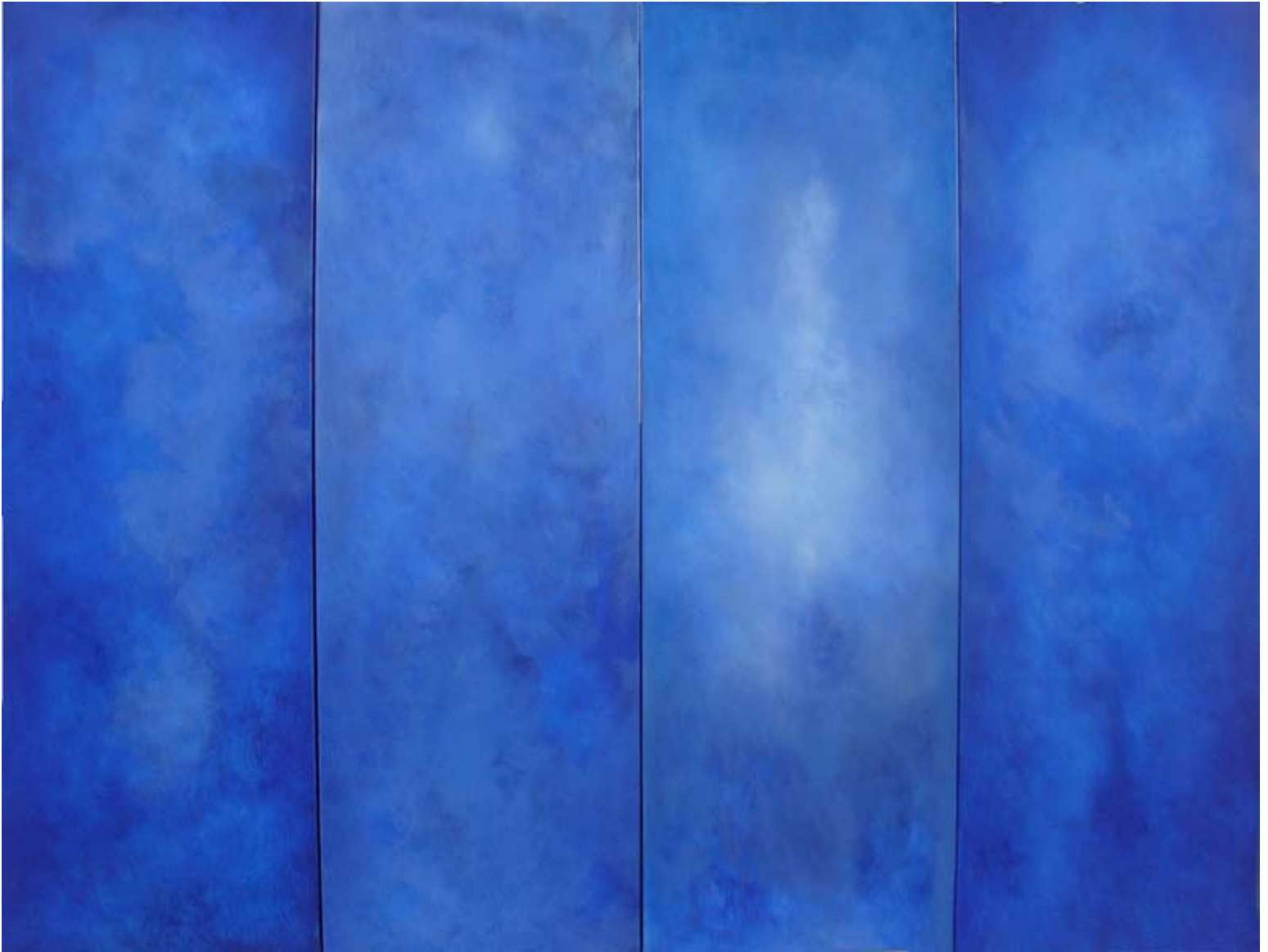
THE BLUE GATES OF PARADISE, 2009 oil on canvas (4 panels) 60 x 80 in. 152.5 x 203 cm. 60 x 20 in. 152.4 x 50.8 cm. each