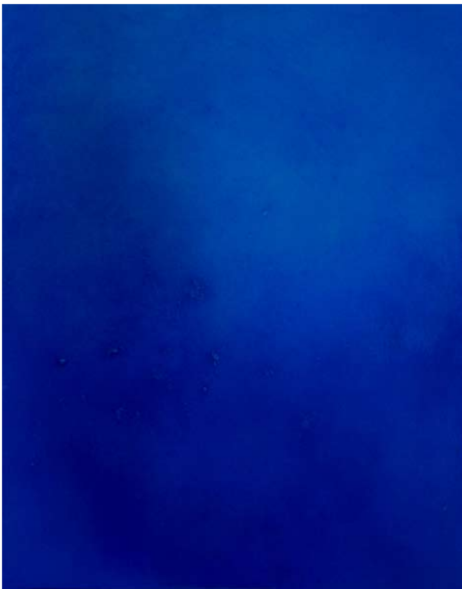
BLUE EARTH #1, 2009 oil on canvas 18 x 24 in. 45.8 x 61 cm.