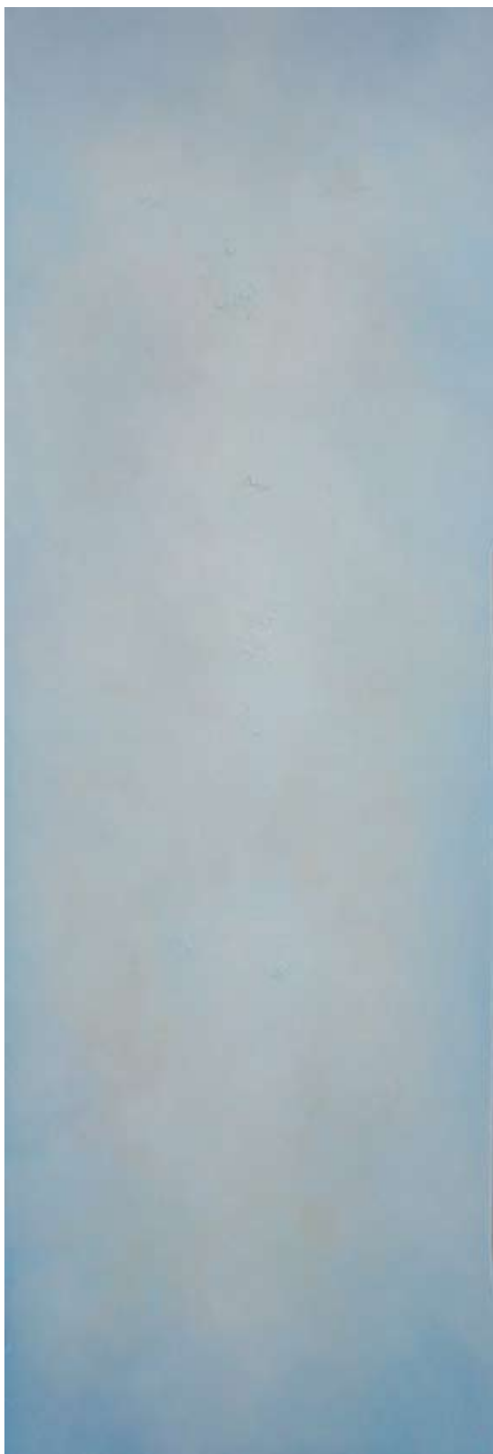
BLUE REFLECTION, 2009 oil on canvas 60 x 20 in. 152.4 x 51 cm.