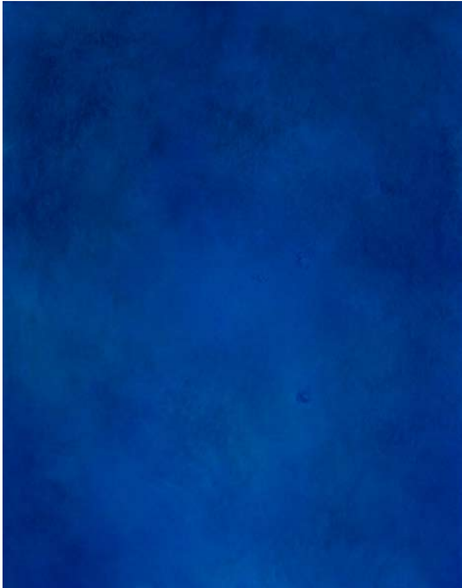
BLUE EARTH #2, 2009 oil on canvas 18 x 14 in. 45.8 x 61 cm.