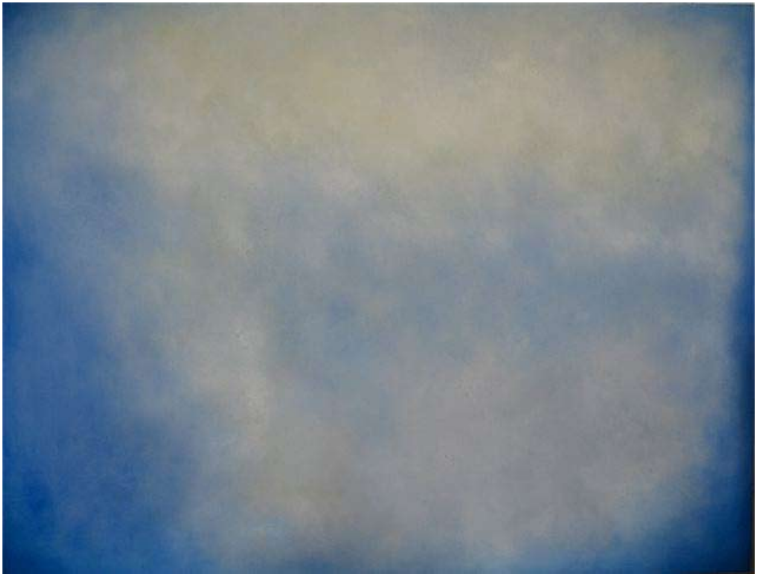
DERVISH RISING, 2009 oil on canvas 60 x 80 in. 152.5 x 203 cm.